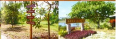
A homely feeling At Thailife Homestay