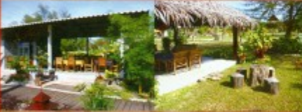
At the Coffee shop In the Sala at the Lagoon