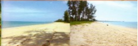
At the pristine Beach