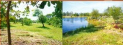
In the 25 year old Cashewnut Gardens