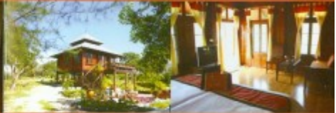
In your comfortable room